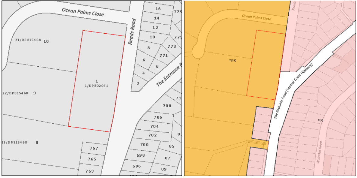
Figure 1 - Lot Description

The site adjoins 7(c2) zoned land to the north, west and south. Land to the east on the other side of Reads Road is zoned R2 Low Density Residential. The land has a westerly aspect with slopes between 11% and 15%.