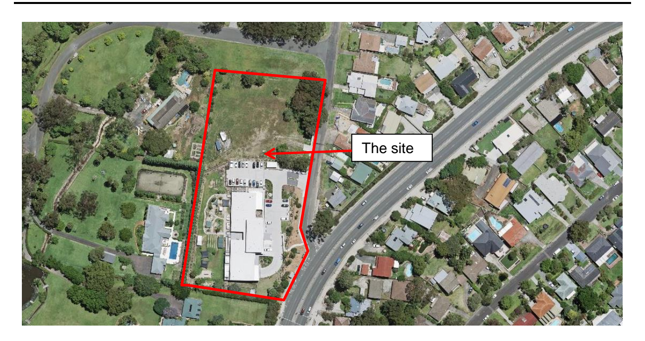
Figure 3 – Aerial View of the site